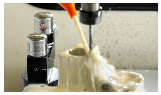
The Renishaw NC4 system is used to prevent damage caused by damaged tools to very expensive parts - eliminating resultant scrap, re-machining and wasted time.

He continues "The NC4 also allows us to check for breakages of small tools used to make keys and other reference points on the cam, which are vital if the engine is to operate properly. If it wasn't for the Renishaw system, the machine could, for example, operate with a broken cutting tip, with disastrous results. Furthermore, since tools are checked for breakage automatically, one operator can easily manage both machines: all he needs to do is load the pieces and ensure that everything is running smoothly".