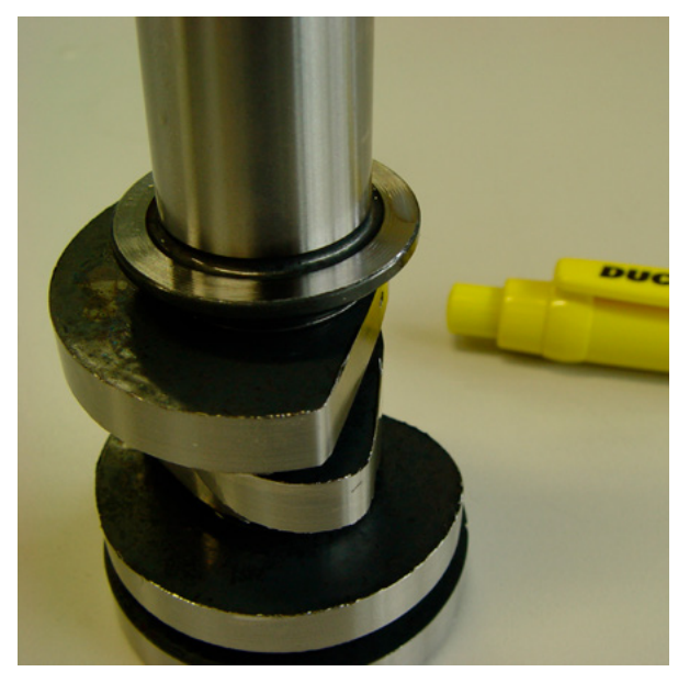
The Desmodromic camshaft is not conventional, and has been designed with special 'lifting ramps'

The Desmodromic system introduces major complications to the design and manufacture of components such as camshafts. The cam itself is not a simple conventional cam shape, instead using special lifting ramps. Ducati's design team has carefully designed the shape so as to achieve the required acceleration and speed performance. Precision is everything; the "clearance" between the stem and the cam is adjusted by hand during assembly and is a critical operation. As Abbondi says "it's not possible to take up the slack as you can with hydraulic tappets on cars. We use one pad at the bottom and one at the top and these must be adjusted with extreme precision."