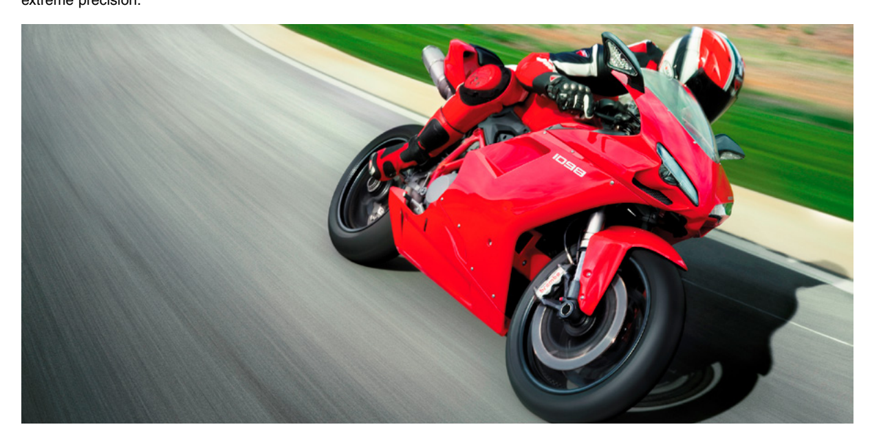
The Ducati 1098