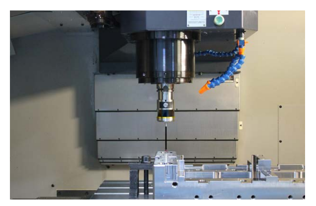
RMP600 probing the mould plate