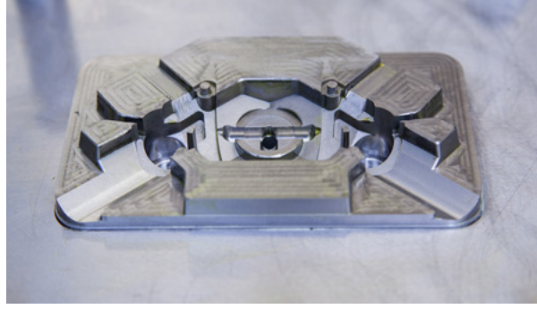
Complex mould tools are easily set up using the Renishaw touch-trigger part setting probe

"We can probe and datum the vast majority of our work within three minutes, but we are occasionally presented with special challenges," he explains. "Recently we needed to rework an existing mould tool using only a CAD model and the old tool, which didn't have a single recognisable datum point on it. Eventually by cross-checking, we evaluated 20 datum points. This took about an hour using the Primo Radio Part Setter. Without the probe, I estimate it would have taken at least half a day. The time savings on second operation work is, for us, where probing really comes into its own and benefits our business. In combination with a CAD model we are able to quickly pick up multiple datum points and start cutting the part much quicker than we could ever do manually, without probing. The time we are saving more than offsets the cost of the Renishaw probing system."