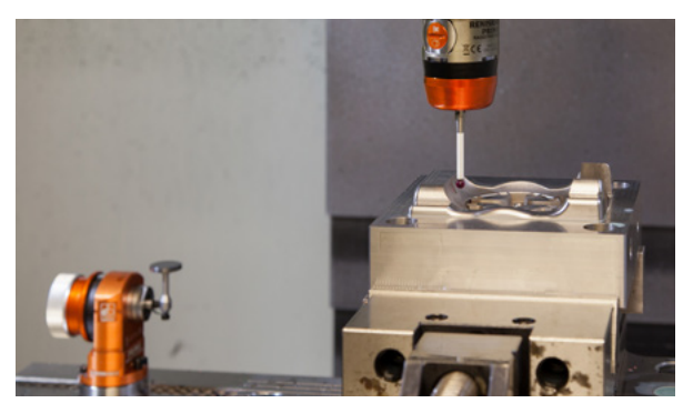
The Renishaw Primo™ system has enabled significant efficiency gains at BK Tooling through reduced set-up times

"Buying a machine like this without probing is something that I would not even contemplate. Yes, you can set parts manually, but you do that without any confidence in where the datum is. Probing is all about having the confidence of knowing where the part is on the table and not standing there hovering over the feedrate override," explains Bob Tunks.